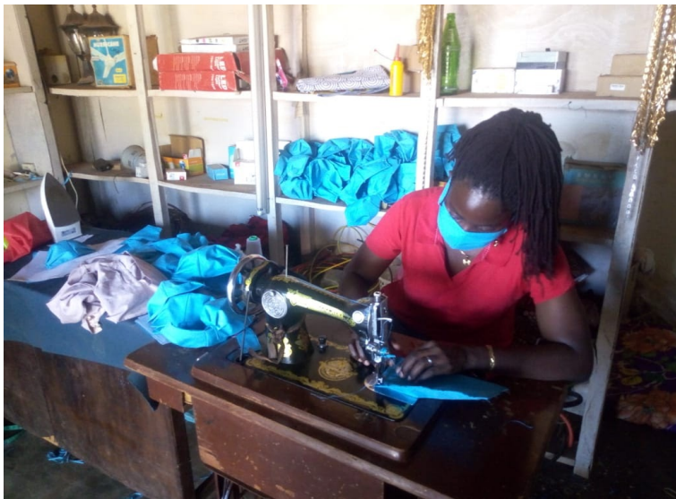
A female entrepreneur in Funyula, Kenya makes masks for NEF.

At Busijo Secondary School in Western Kenya near Lake Victoria where NEF operates, teachers are using WhatsApp to communicate with students and post assignments, but this method depends on students having access to technology. About half of the 69 Form 4 (senior) students participated in the distance learning. Even in the best of times, conditions at Busijo