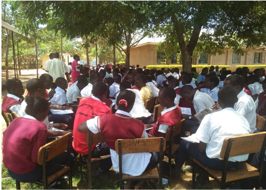
Busijo Secondary School students attending the first college advising workshop, sponsored by NEF.

Due to COVID-19, NEF was not able to organize a student workshop at Busijo Secondary School in 2020. Instead, the money that is generally set aside for this purpose was channeled toward providing other types of support to students and the community.