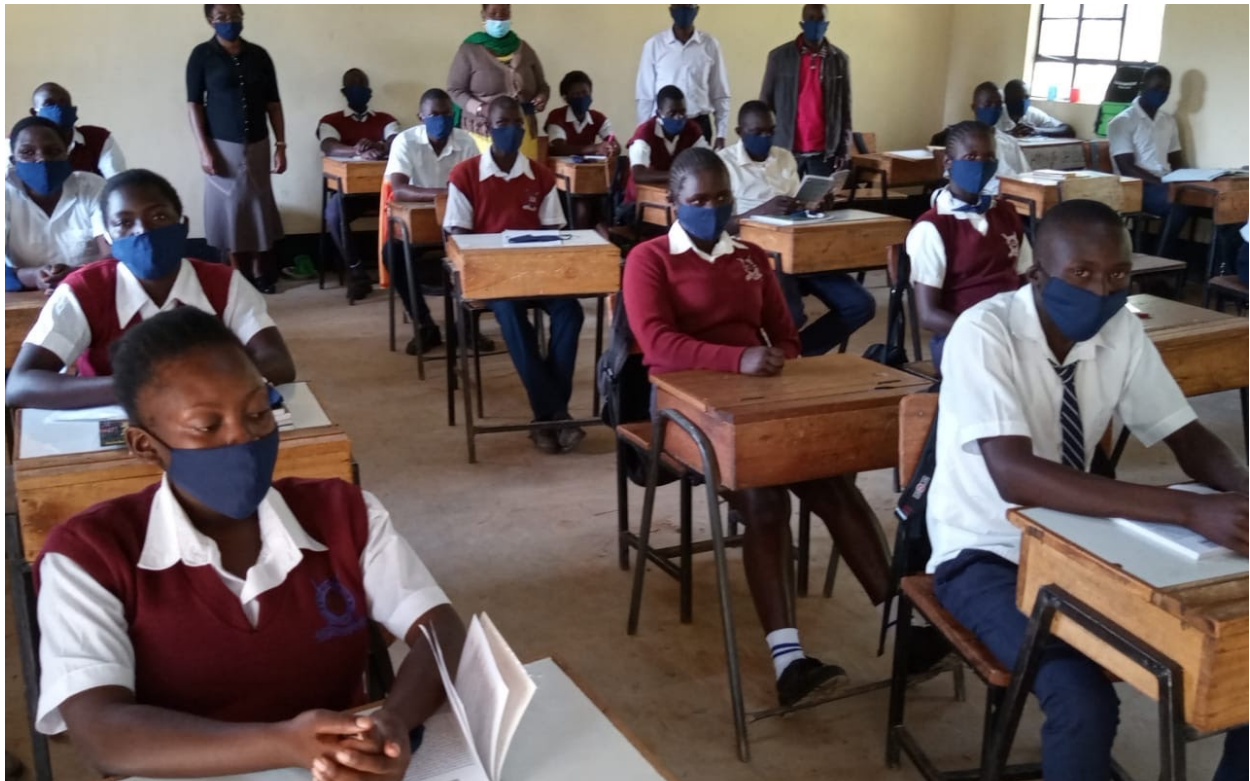
Busijo secondary students in class with face masks provided by NEF.