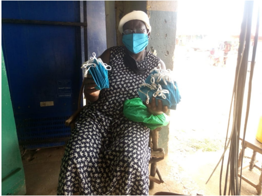
Community members wear masks distributed by NEF.