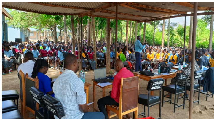
Bujwang`a secondary students listening to the facilitator during the workshop.

In July 2023, NEF sponsored and helped organize two health workshops to the high school students of Busijo and Bujwang`a secondary schools. The health workshops provide the adolescents with information and tools on key preventive health and well-being topics that positively influence the youths` immediate and long-term health outcomes, such as reducing risky behavior that can lead to sexually transmitted infections (STIs), including HIV, unintended pregnancy, and drugs/substance abuse, while also improving self-esteem and academic performance.